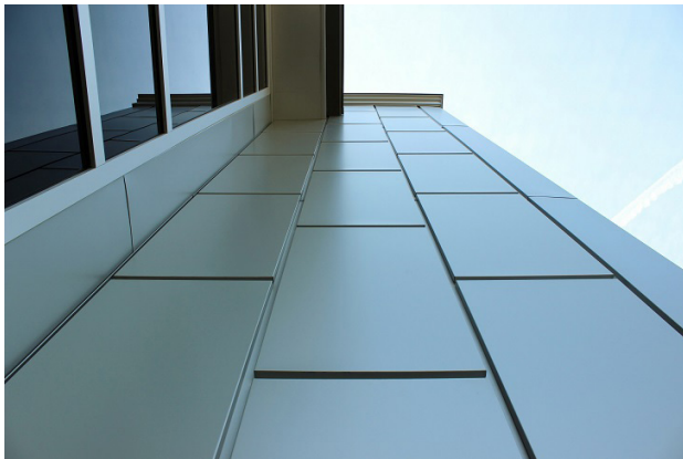
Element Panel Orientation

* For Galvanized Steel, Stainless Steel, United Zinc and Copper panel size availability, please contact your IMETCO rep.